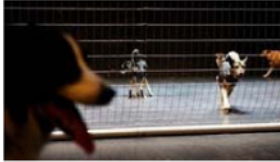
Cap (left), the eight-and-a-half-year-old Border Collie, walking on the stage of a Zagreb theatre where ...

ZAGREB (AFP) - Stray dogs play a star role in a groundbreaking Croatian show that has won rave reviews for raising awareness about abandoned canines and homeless people.